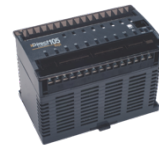
Locution PrimeAlert® Program Logic Controller (PLC)