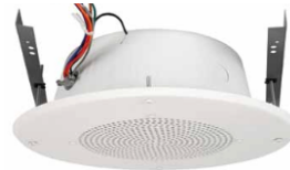
Ceiling Loudspeaker Blindmount Location TSPK-CL-BM Use: hallways, stairways, dorm rooms

Indoor use Sensitivity: 92 dB SPL, 1W/1M Power Rating: 20W RMS, EIA 426A Standard Freq Response: 65 Hz – 17 kHz, EIA 426A Standard Nominal Coverage Angle: 90° Included Angle, -6 dB/2 kHz half space Dimensions: 12 7/8 " Diameter x 4 1/16 " depth