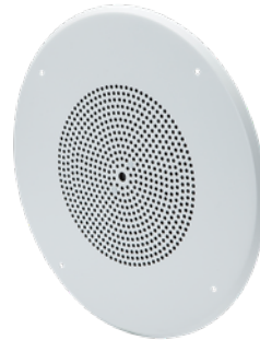
Ceiling Loudspeaker Location TSPK-CL Use: hallways, stairways, dorm rooms

Indoor use Sensitivity: 95 dB SPL, 1W/1M Power Rating: 20W RMS, EIA 426A Standard Max Power Rating: 15W @ 8 Ohms Freq Response: 65 Hz – 17 kHz, EIA 426A Standard Nominal Coverage Angle: 100° Included Angle, -6 dB/2 kHz half space Dimensions: 12 7/8 " Diameter x 2.5" depth Weight: 4.2 lbs Color: White powder coated finish