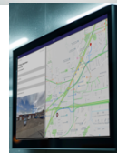
Touchscreen Monitor Locution 50XT Use: Hallway near bunks for Station Zone Tracker, common areas for Responder Station