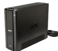
Uninterruptible Power Supply (UPS)

Available versions: 700 VA, 900 VA, 1050 VA, 1500 VA, 2200 VA