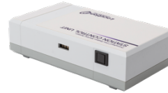
Locution PrimeAlert® Station Control Unit (SCU)

Supplies 4 general purpose control relays